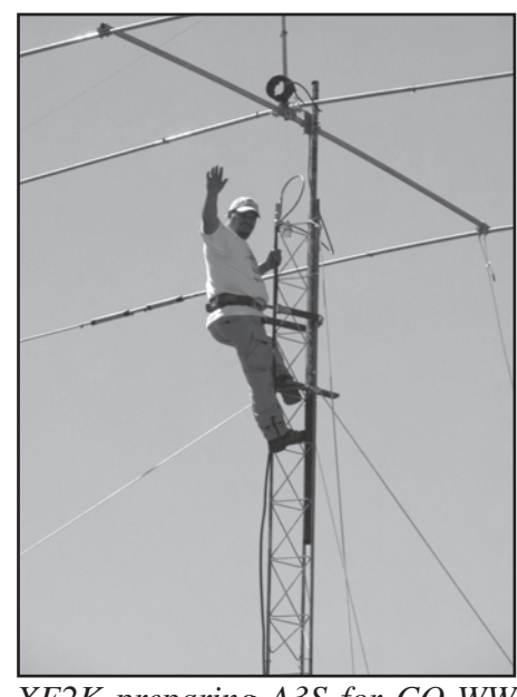
XE2K preparing A3S for CQ WW contest.

Unfortunately we were unable to disassemble the three-element 20M beam, the Titanex V80 and the Butternut HF9V before the storm hit the island. After the hurricane, the 20M beam elements had a nice V-shape, but the verticals didn't show