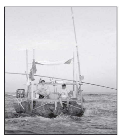
I8NHJ and AA4NN setting up the first station, Rock No. 2 at dusk.

things along, turned to DL3MBG and K4UJ and asked "Can you two have that rock on the air in less than two hours?"