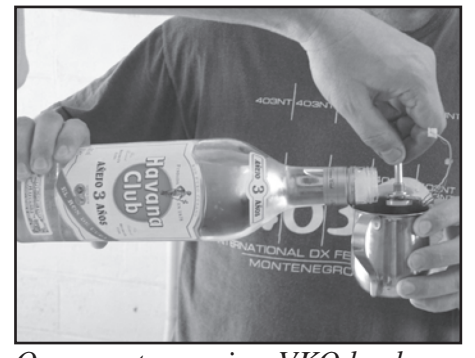
One way to repair a VKO knob.

Our motivation was excellent and was even strengthened by positive