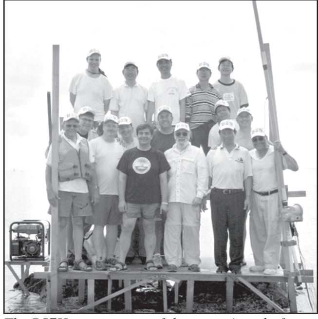
The BS7H team on one of the operating platforms.

1 May quickly turned into a day of reckoning, reaching a point where every aspect of setting up and becoming operational became a major roadblock with the limits of each operator stretched. As events unfolded, 9V1YC, in an effort to move