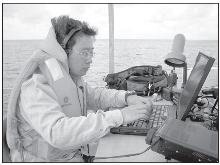
BA1RB operating on Rock No. 1.

Sleeping on the boat was a challenge due to the constant rocking side to side as well as fore to aft. When everyone finally fell asleep, we were awakened by seasick teammates with dueling barf buckets sliding around the sleeping quarters.