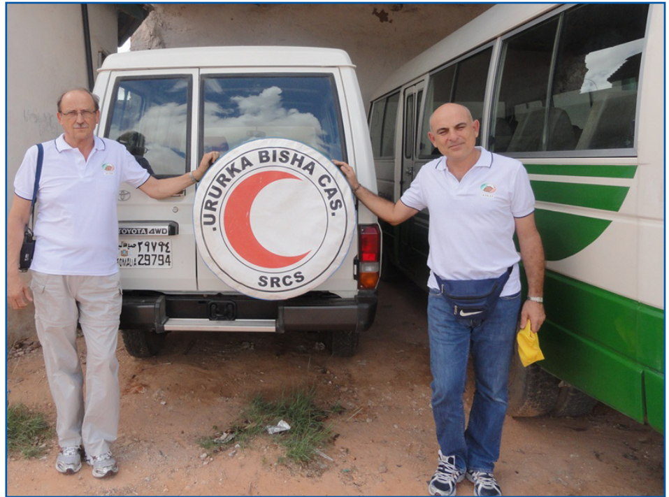
I2YSB and IK2RZP visit the Red Crescent.

We immediately started our planning and the doctor found a good location for us: the villa of the former (now deceased) President was sometimes rented to Europeans who needed to stay in Galkayo (there are no good hotels in that area). Despite the high cost, we accepted the offer because the large garden would be ideal for our antennas. There was also a 70-meter tower for microwave links and we were already dreaming about hanging a 160M beam from it!