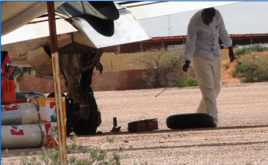
Our aircraft with a wheel to be replaced.