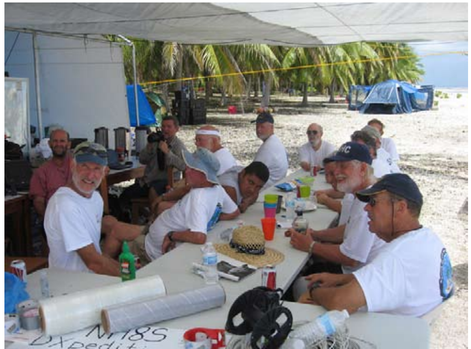
Just hanging out between shifts.

QSLing is an important and tedious job. Joe4, AA4NN, volunteered to respond to the paper QSLs, but we wanted to use technology as much as possible to simplify the whole process. We examined several systems and Clublog was chosen for its robust features — simple uploading, embed-