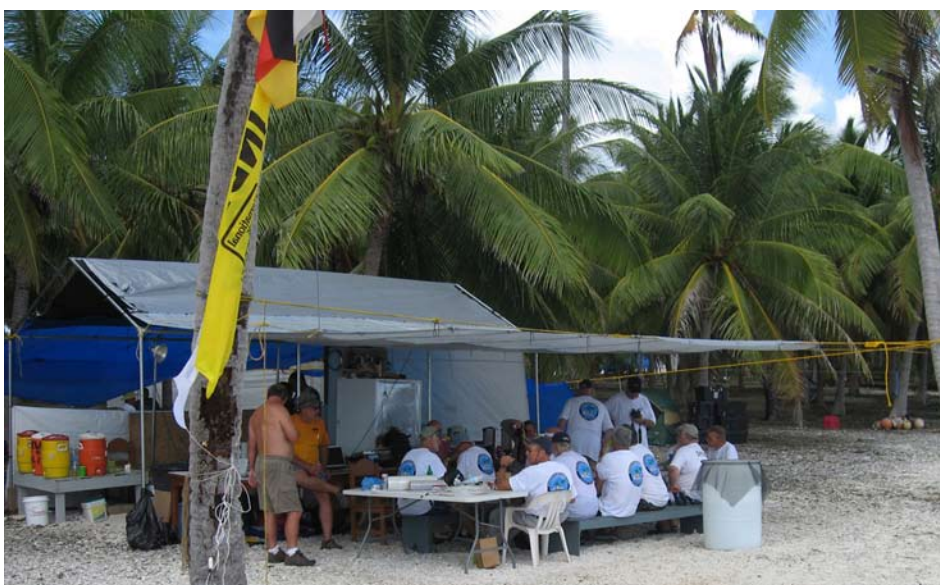
Our "living room" for two weeks!