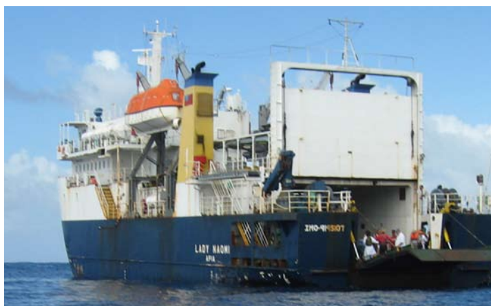
Lady Naomi transported us from American Samoa to Swains Island.