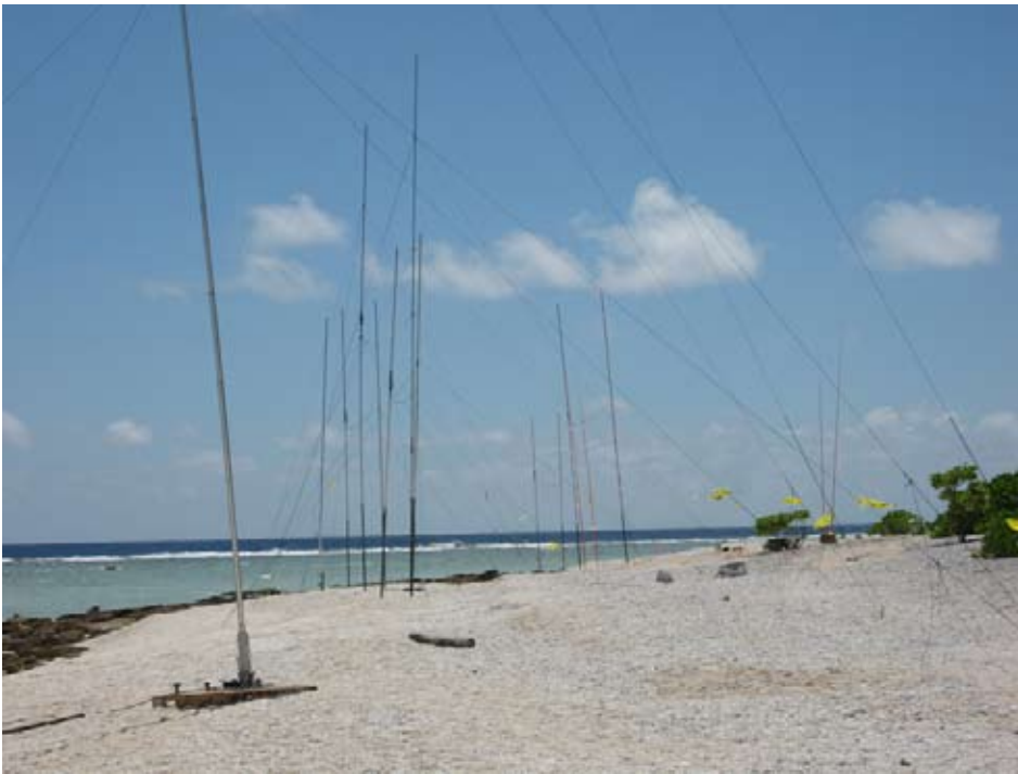
The antenna field for SSB.