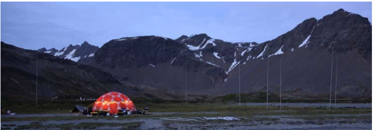
80M two-element array, 40M 4-square and 160M two-element array and spare aluminum at VP8SGI.

Working VK and ZL was a challenge at these two sites since we had to rely on paths through the polar absorption regions that were activated and subsequently disruptive to radio circuits as a result of the effects of recent solar ejecta. With the improved conditions and mild weather, the QSO rates that were produced on South Georgia exceeded