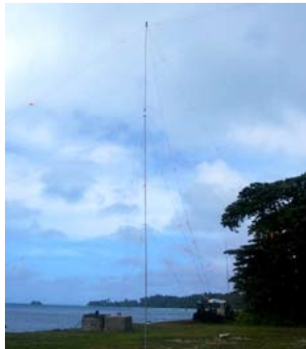
The 22-year-old Battle Creek Special. World record holder for ups and downs!

Upon arriving at the terminal we had a mandatory briefing by USFWS followed by a pilot briefing. After which we were told that, with the checked bags on board, there was no more room for our carry-on