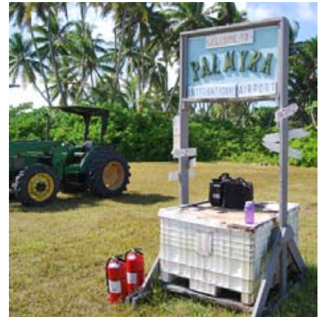
Palmyra International Airport terminal.