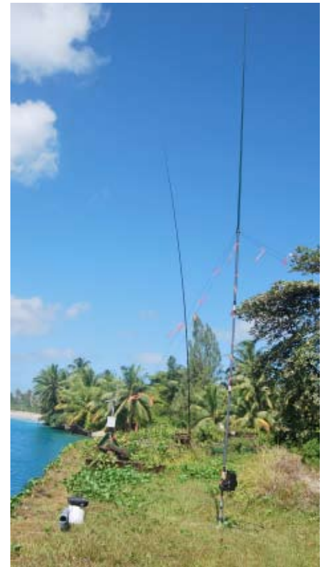
West SteppIR BigIR and 80M Spiderpole vertical in background.

After a mandatory briefing by TNC on rules and how the camp operates, we quickly threw our belongings into our assigned cabins and headed to the Dry Lab and wharf area to begin our deploy-