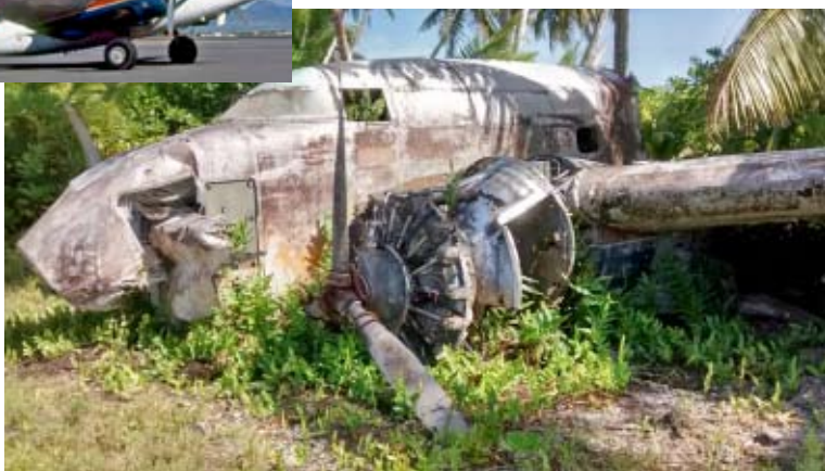
Right: The plane as it sits on the island today.