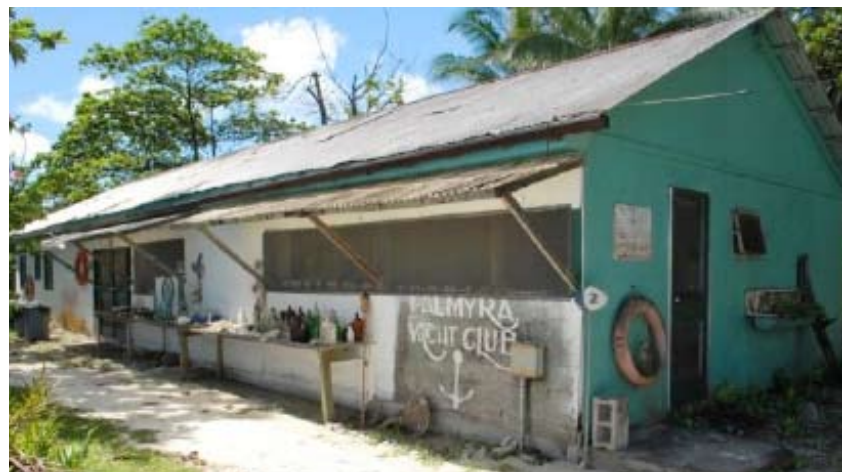
The Palmyra Yacht Club.

The days passed by all too quickly as we had our noses to the grindstone.