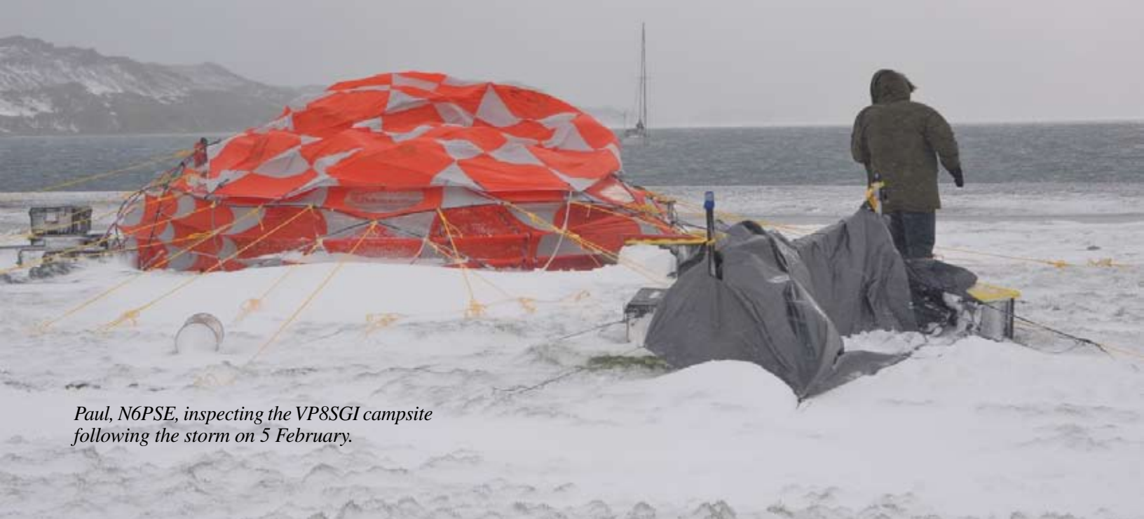
Paul, N6PSE, inspecting the VP8SGI campsite following the storm on 5 February.

those on Thule, as well as any projections we had made during planning. With the mild weather and available space at the VP8SGI site, the team expanded the low frequency antennas to the maximum extent possible.