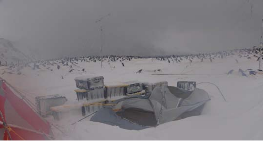
VP8STI following the storm on 24-25 January with the Bio Station tent and a second sleeping tent buried under the snow.

museum in Grytviken, inspecting the many artifacts from the whaling.