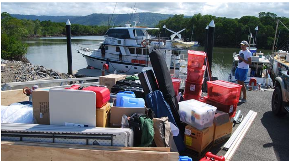
Would all of our gear fit on board the Phoenix?

designed to have nearly identical equipment and support for all modes — CW, SSB and RTTY — which enabled any team member to operate at any station with minimal adjustments and configuration.