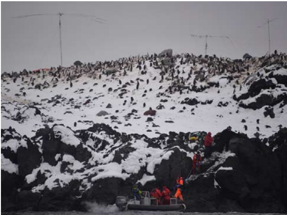
Moving material up the rock-faced cliff at VP8STI.

two gentlemen spent endless hours over the two years while preparing for this trip.