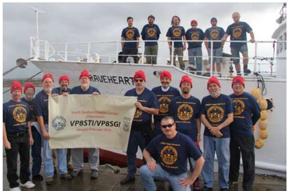
73 from the VP8STI/VP8SGI team and the Braveheart captain and crew.