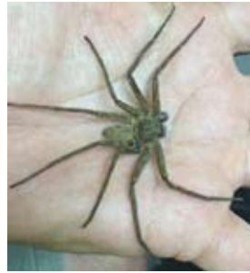
Some of the island's fauna: coconut crab (which can grow up to three feet), hermit crab and king spider.