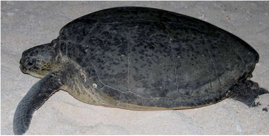
One of the local island residents.

on the north shore, 500 feet from the landing site, to be optimal; not only for propagation to the north, but the steep slope of the shore would minimize impact on nesting turtles. Making 20 trips in the small dinghy and carrying two tons of gear over the difficult 500-foot expanse of sand was difficult and the soft, white sand added to the sun's intensity. Despite several applications of SPF 50 sunscreen, many team members found themselves sunburned on the first day.