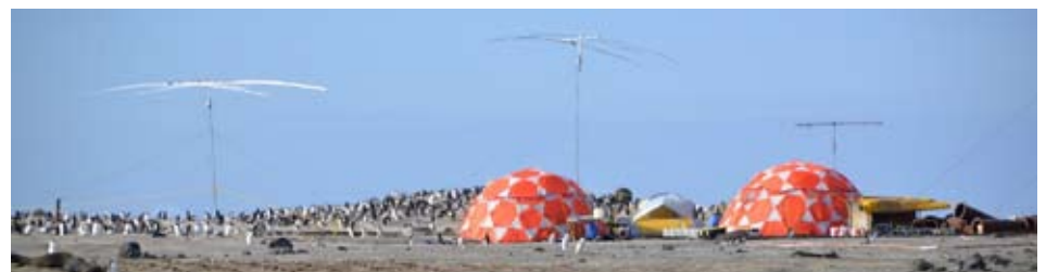
VP8STI operating site with HF Yagis on top of the ridge.

We sailed into South Georgia's King Edward Cove on 14 January where we were required to meet with officials in order to complete training for all members as well as conduct some critical inspections of the vessel for operations in these islands. We all mustered ashore and took advantage of the opportunity to stand on terra firma and visit Sir Ernest Shackleton's grave and then took a walking tour around the South Georgia