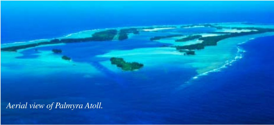
Aerial view of Palmyra Atoll.

application was the one accepted for operation on Palmyra.