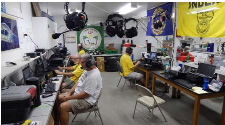
The operating positions in the Dry Lab.

We had an SAL-30 receive array, which we initially put up near the Dry Lab, but there was a lot of desense and noise picked up from laboratory equipment. We were able to move it 800 feet further and found that location extremely quiet! Without this antenna we would not have had the success we had on 160M and 80M. We had the usual tropical QRN, but surprisingly little in the way of local