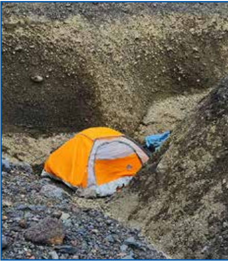
Mike, Dave and Peter spent a crowded second night in their respective sleeping bags, tucked inside a ravine to shield them from the elements.

used. In addition, because a 60-knot storm was predicted to hit the island a few days later, it was necessary to return to the vessel during the first possible weather window in order to fix the Zodiac, and reset our strategy for going ashore in difficult conditions.