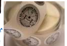
Roll of 500 labels

Send me the following supplies (shipping included):