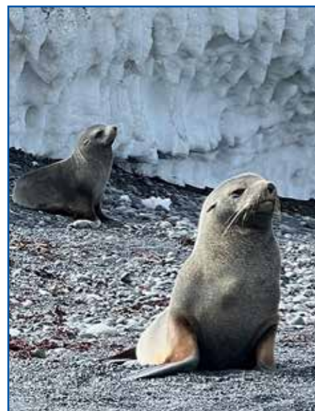
Residents of the nearby fur seal colony.

Continental distribution of contacts is shown in the following table. Among the most operated bands, the propagation conditions favoured Europe on 15M, Asia on 17M, and North America on 30M. The relatively lower percentage of contacts on 30M, which is also partly responsible for the relatively lower percentage of contacts with North America, was due to the team not being able to use the generator during the last few nights on the island.