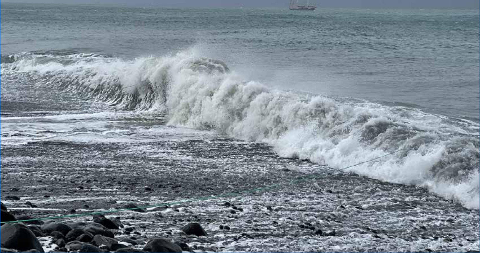
The massive surf during the storm as Marama rests at anchor in the background.