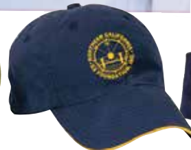
Navy blue ball cap (one size, fits most)