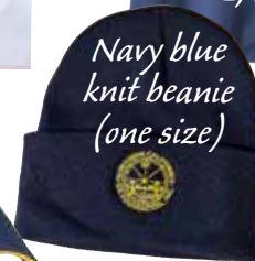
Navy blue knit beanie (one size)