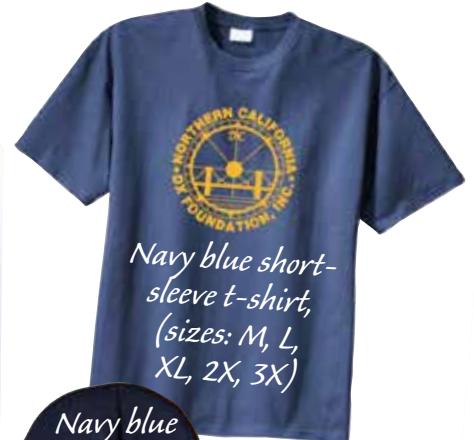
Navy blue short-sleeve t-shirt, (sizes: M, L, XL, 2X, 3X)