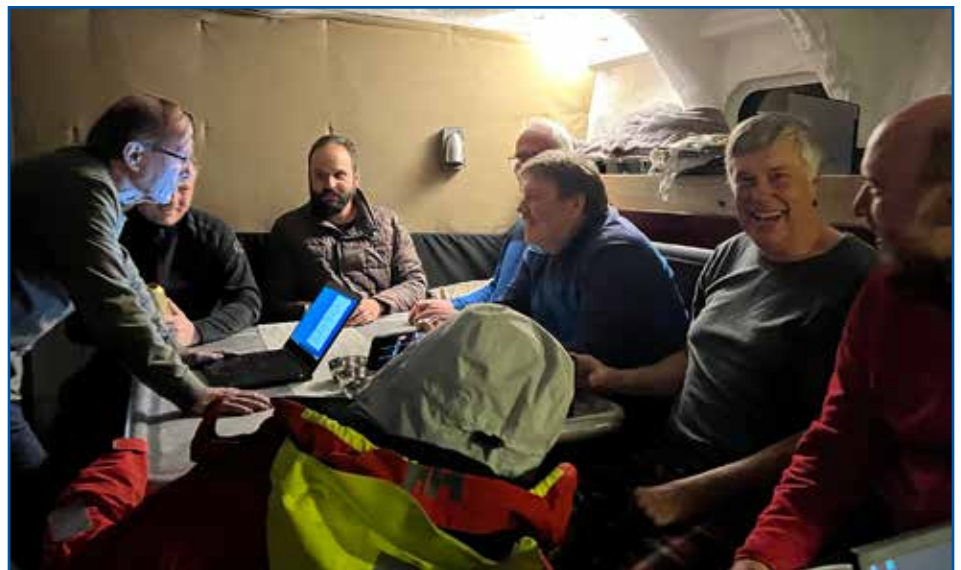
Evening entertainment aboard Marama.

After two weeks at sea, on 30 January after sunset, Marama anchored off Bouvet Island. The weather was relatively calm, and the forecast suggested that we might be able to attempt landing the next day. As such, we went to bed dreaming about what we would do next.