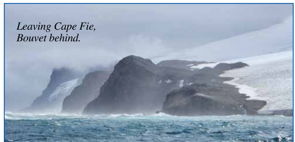
Leaving Cape Fie, Bouvet behind.

The cost of the project came to $705,000, of which the largest share was allocated to retain the services of the yacht Marama and its crew. While 34% of this was shared by the team, the remaining 66% was obtained through fundraising, from donations