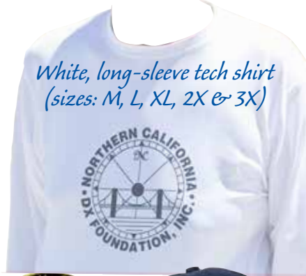
White, long-sleeve tech shirt (sizes: M, L, XL, 2X & 3X)