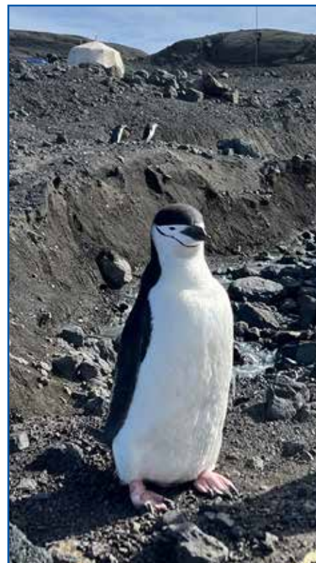
Chinstrap penguins near the camp.