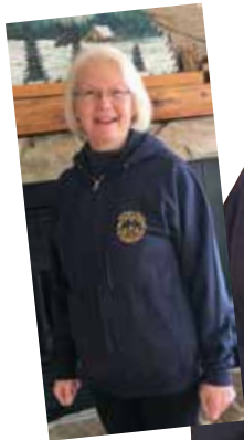
Navy blue long-sleeve hooded sweatshirt with full-length front zipper and pockets (sizes: S, M, L, XL, 2X & 3X)

NCDXF offers several ways for you to show your love for DXing! Impress your friends with a gold-toned lapel pin at a DX convention. Show up at your next hamfest sporting a NCDXF ball cap, don a NCDXF T-shirt or keep warm wearing the new NCDXF 50th Anniversary hooded sweatshirt or knit beanie to set up your Yagi on Field Day. We've also added wicking long-sleeved tech shirts to keep you looking and feeling cool on your tropical DXpedition. And when you return from that rare DX entity, you can send out your QSLs affixed with an NCDXF label. To place your order, fill out and mail in the form below or visit www.ncdxf.org to place your order online through our secure website. Please note, due to drastic increases in mailing costs, shipping (included) is only available to US addresses.