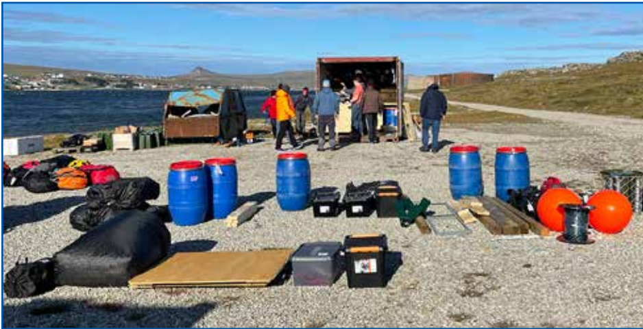
Unloading the container in Port Stanley.