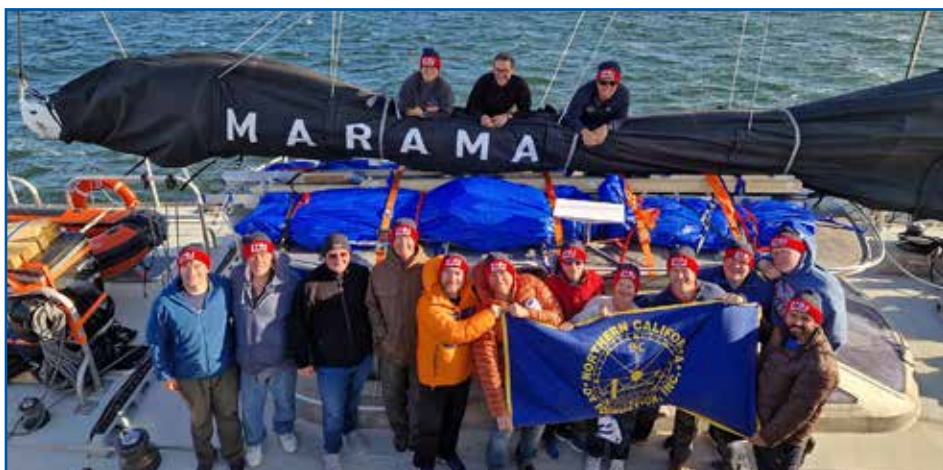
The team ready for the voyage aboard Marama.

The team decided to meet in London, UK, from where they departed aboard a RAF military supply plane to Port